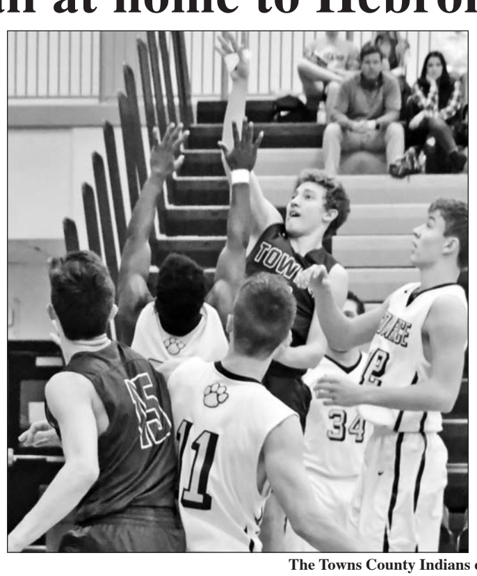
The Towns County Indians during last Friday's win at Commerce.

At press time, the Indians are scheduled to take on Lakeview Academy at home on Tuesday of this week and travel to Bogart to face Prince Avenue Christian on Friday before ending the week at home on Saturday against Class AAA Fannin County. Those attending the games should take note that the JV games against Fannin are scheduled to start at 2:00 pm with the varsity games to begin